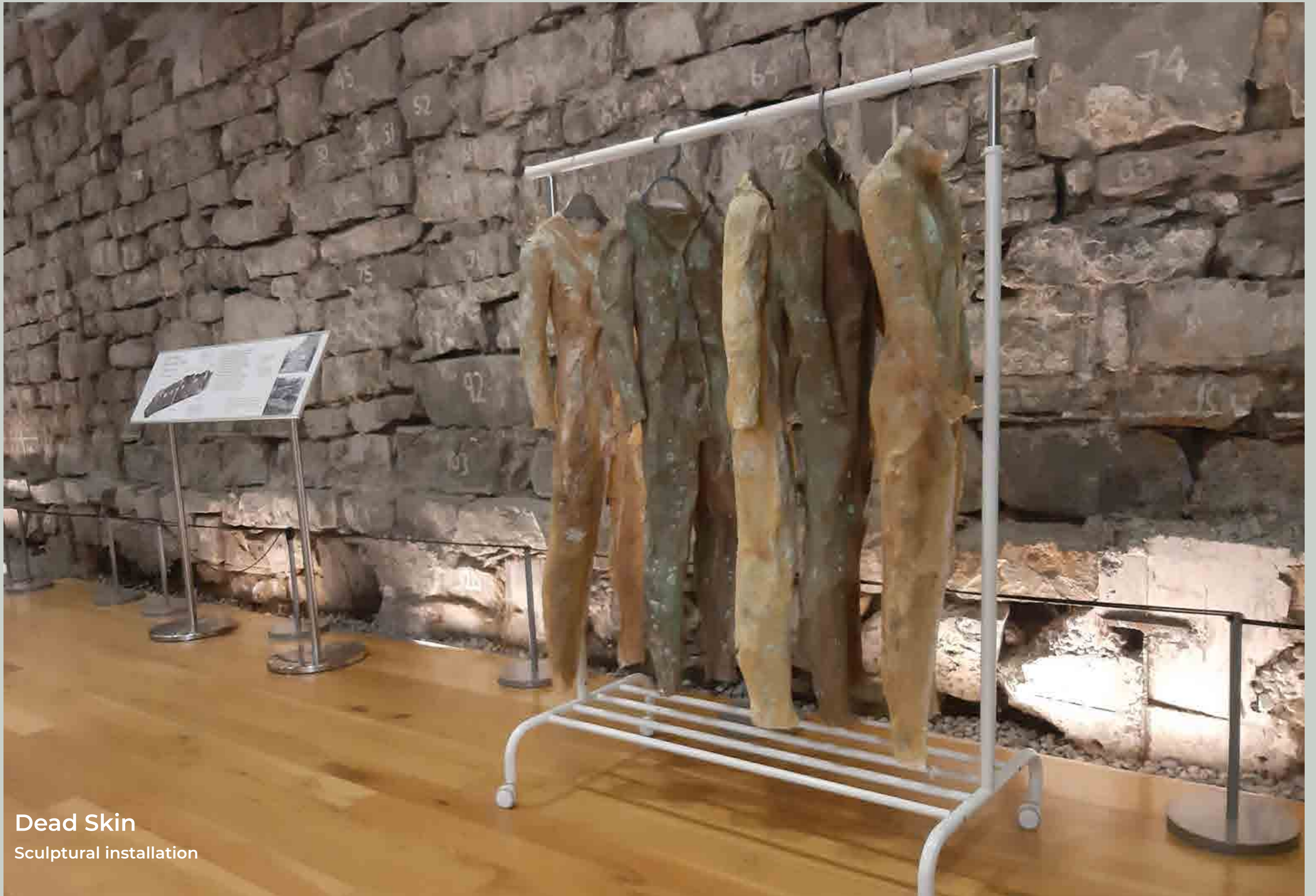
Dead Skin Sculptural installation